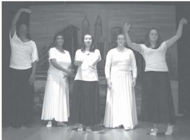
"New Life for Girls" takes the stage at Impact Theatre

co-dependent. He cites the novel The Shack , which on page 110 says, "I am the best way to the Father." He clarifies, "Jesus doesn't give us options to mess with his Gospel and interpret it as we please." His last example is the seeker-friendly movement, which only presents the pabulum of the Gospel. He knows of one men's cell group whose idea of fellowship was to get together, watch "Survivor", and then close in prayer; no accountability.